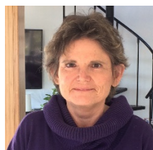
Colleen Fitzpatrick, PhD, widely recognized as the founder of modern forensic genealogy.