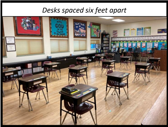
Desks spaced six feet apart