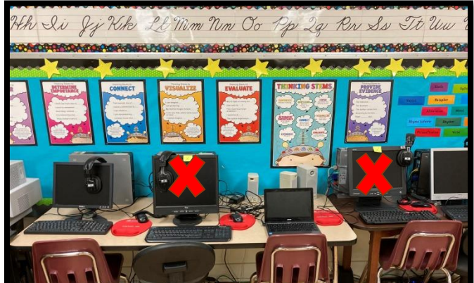
Every other computer not in use to ensure social distancing