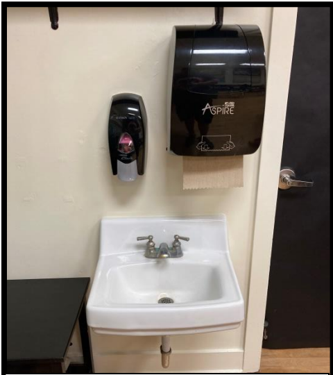
Hand washing stations in every classroom