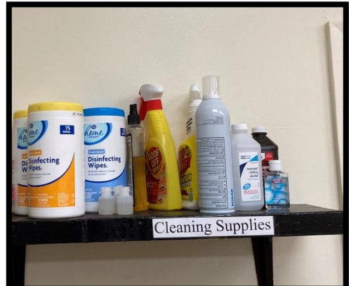
Cleaning and disinfecting supplies in every classroom