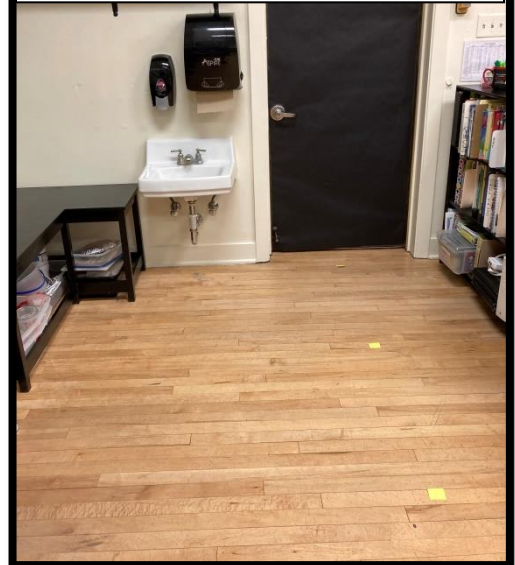
Social distance markings on floors for lining up